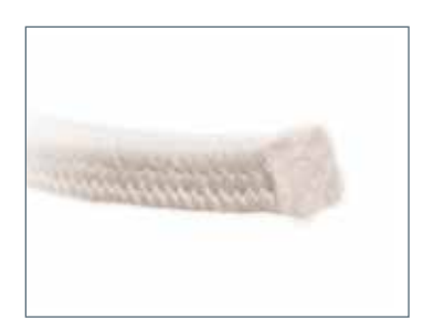
STYLE 5888, 5889, 5904

High density, non-porous PTFE continuous fiber resists chemical attack and prevents leakage through the braid. Ideal for valves and pumps in the chemical and food processing industries.