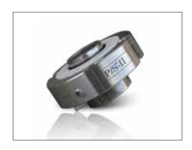
P/S®-II MULTIPLE LIP SEAL

Cartridge seal with multiple sealing elements offers excellent performance in thick, viscous fluids; especially effective in positive displacement pumps.