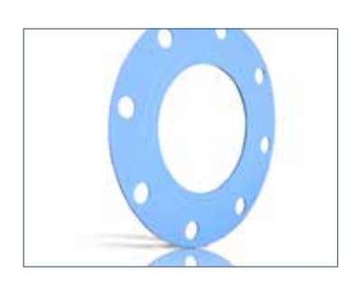
GYLON® STYLE 3504

The molded raised ribs help to create a tighter seal by concentrating the compressive load, ideal for lightweight piping.