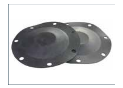
HIGH PERFORMANCE RUBBER DIAPHRAGMS

The trusted solution for more reliable and longer lived pump and valve diaphragms. Offered in a variety of high performance rubber compounds; we also have the ability to design compounds to meet customer specific requirements.