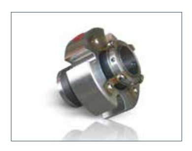
GMP-I & II SEALS

Single or double cartridge seal fits all standard ANSI pumps; especially well-suited for centrifugal pumps.