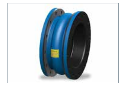
STYLE 204, 204HP, 204EPS