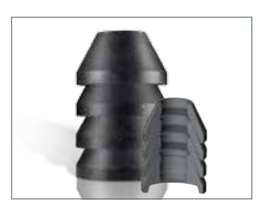
LUBRIKUP® CONE PACKING

LUBRIKUP® has the quality and experience to satisfy your Cone Packing needs. Cone Packing is available in a wide range of materials: Regular, TEFLON* Flake, DURAGOLD™ (Brass Flake) Impregnated, a Blended DURAGOLD and TEFLON® Flake, or DURATUFF®.