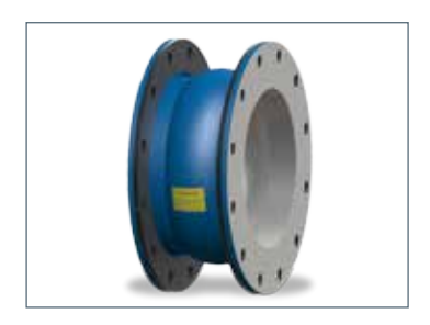
GUARDIAN® 306 EZ-FLO®

This expansion joint flowing arch design prevents media buildup and reduces turbulence. The FEP liner resists corrosive attack at elevated temperatures and pressures, making it ideal for the chemical processing and pulp and paper industries.