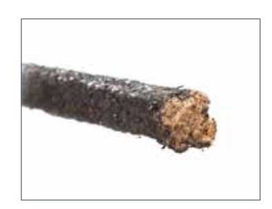
STYLE 8909, 8913, 8921-K, 8922

Lubricated, braided synthetic fiber packing performs well with minimal shaft and sleeve wear. Excellent for general service applications.