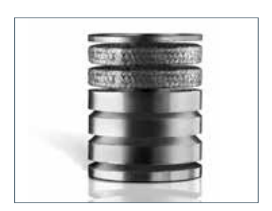
STYLE 8093 DSA

Innovative pump packing set engineered for dry running and reduced flush water consumption.