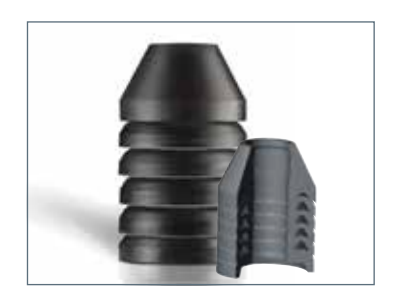
LUBRIKUP® FLUID-SEAL™ CONE PACKING

The sensational performance of Fluid-Seal Rod Packing in a cone-type stuffing box. Lip-type sealing action and space between each ring creates a perfect, nonbinding fluid seal.