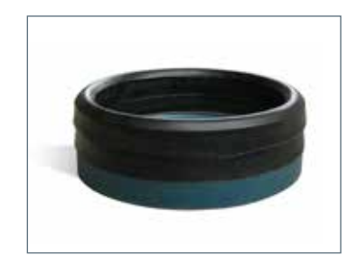
BLUE DURATUFF® WELL SERVICE PACKING

Blue DURATUFF® was designed to provide maximum sealability for high pressure well service pumps. The propriety material was developed to eliminate extrusion and provide excellent abrasion resistance for fracturing, acidizing and cementing pumps.