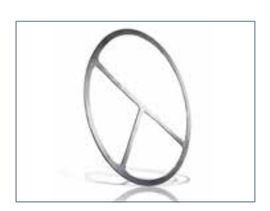
HEAT EXCHANGER GASKETS

Custom configurations available in a wide range of materials and gasket styles. Solutions for almost any application.