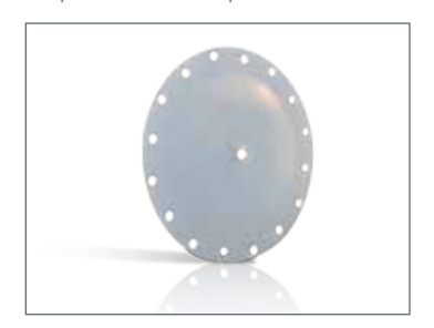
GYLON® STYLE 3522

Exclusive to Garlock, this time proven product is made using a proprietary process which optimizes quality and uniformity. Using the best available technology GYLON® PTFE diaphragms offer the longest cycle life in the industry, and continue to outperform all competitive materials.